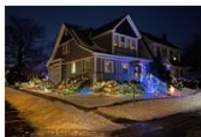
48 Wellesley Street