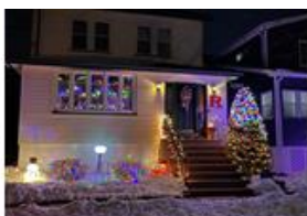
62 Concord Avenue