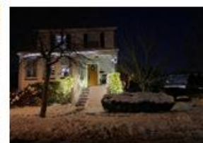
180 Indiana Street