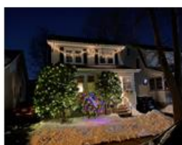
170 Jacoby Street