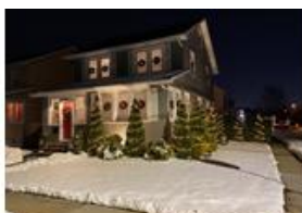
46 Princeton Street

Here are the seven winners who will each receive a gift card from the Bread Stand.