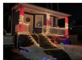
184 Hilton Avenue