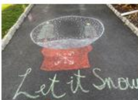
155 Lexington Avenue